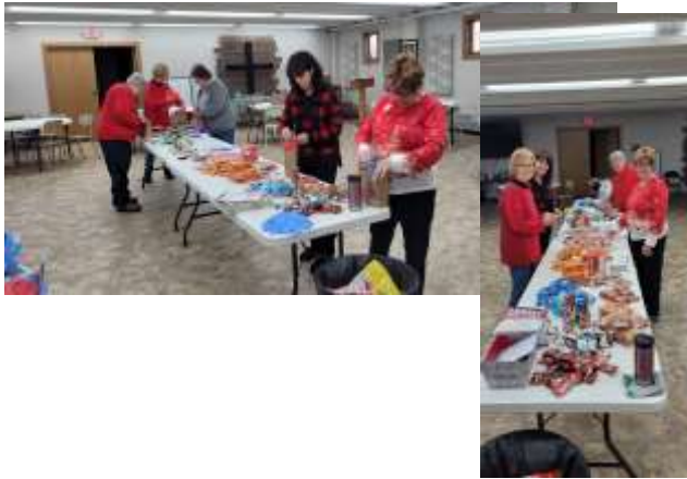
Packing Boxes for the Homebound