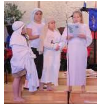
Sunday School Christmas Program